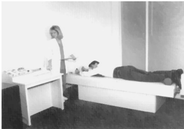
Figure 1: Patient undergoing treatment on the VAX-D Therapy Table

The blood supply to the nerve roots of the cauda equina is sensitive to compression. Even at pressures of only 5-10 mmHg, the flow in over 20% of the venules was completely stopped (6). Flow in all the capillaries stopped at pressures between 20 and 50 mmHg. A pressure of 30 mmHg is slightly less than one pound per square inch, so solute transport is easily reduced. Even vertebral distractions (increased separation) of 1 or 2 mm per disc would reduce ligamental redundancy and help to restore canal/foraminal patency, reduce venous congestion and increase axoplasmic flow. Furthermore, the effects of lumbar spine lengthening may be sustained for a period of time after lumbar distraction has been stopped.